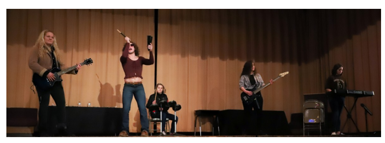
Musicians performed the classic Saturday Night Live skit titled "More Cowbell."

The Loudonville-Perrysville School Foundation thanks the Class of 2019 for their great production of "Senior Night Live," and congratulates them for continuing the now 20-year tradition of Senior Projects.